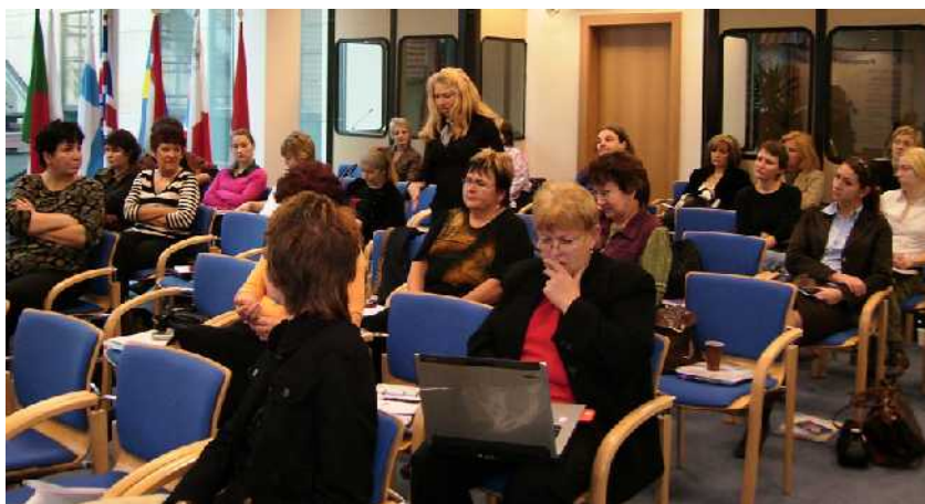
Meeting of local women politician in Prague