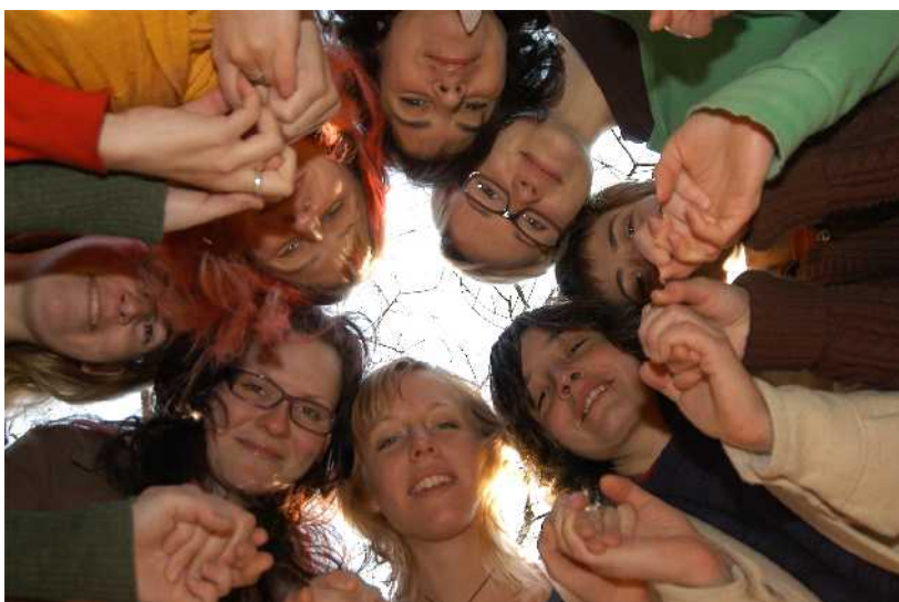
Team of Fórum 50 %