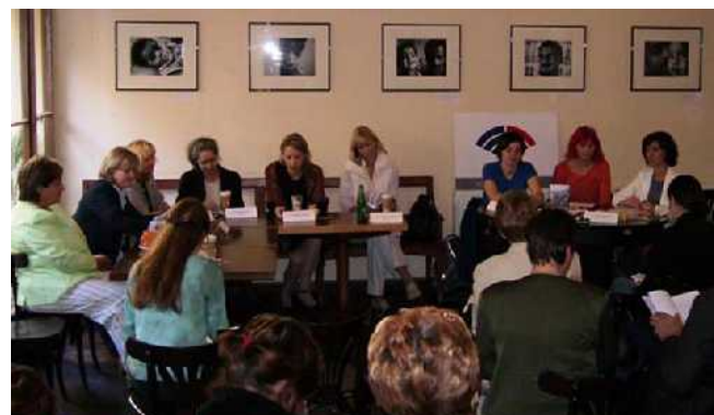
Women Politicians at Opening exhibition “Women Off-side?” and at our press conference on release of the book “Waiting For Women's Velvet”