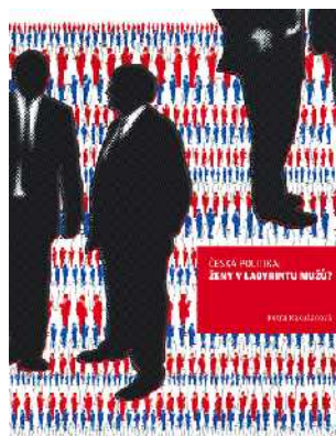
An Analysis: Czech politics: Woman in Men's Labyrinth