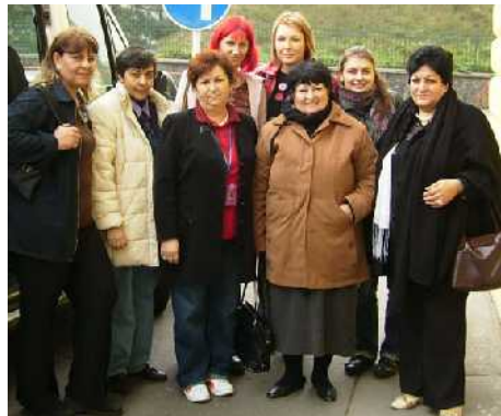
"Azeri" women and their Czech guides

The objective of the project was to provide women workers active in non-governmental, non-profit organizations in Azerbaydzhan with information concerning women's/human rights' issues and to introduce the ways in which these issues are being solved in the Czech Republic. The interactive program was composed of a number of visits to a wide range of civic society organizations. A special attention was paid to the most burning issues for women in Azerbaydzhan, such as domestic violence against women and women trafficking.